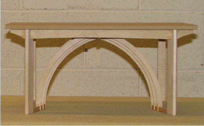
One-fifth scale model of altar table

I have just completed a major commission for St John the Baptist Church in Beeston, Nottingham. The church, which was rebuilt by Sir George Gilbert Scott - architect of St Pancras Station Hotel - in 1843, has been subject to major internal refurbishment. I was recommended to the church authorities by architects Lathams of Derby as the reordering included a large altar table and three chairs (subsequently extended to include a lectern).