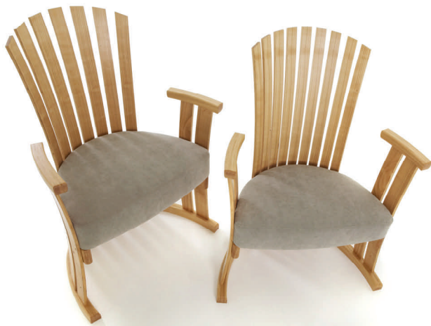
Pair of chairs made to measure in cherry