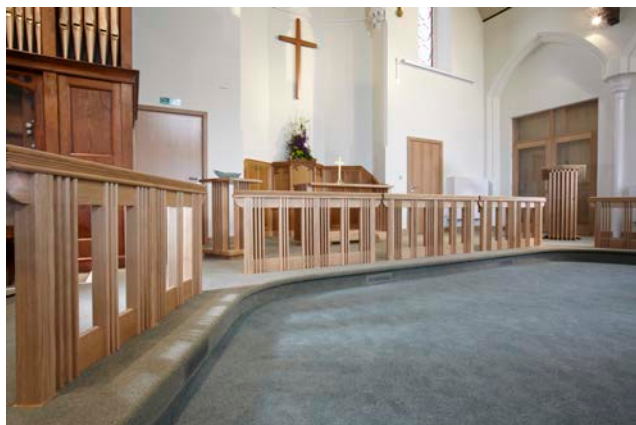
Red Pepper Pictures

Recently delivered, this commission was part of a significant re-ordering scheme for the church. Comprising a communion table, an adjustable height lectern, five sets of communion rails and a baptistery table all constructed in oak, it has taken several months to build. Incorporating the specification supplied, the designs are based around features within the building, particularly the Victorian organ which has been retained, and Christian symbolism including the triangle, cross, and the numbers three and seven. Scale models were constructed to help with visualisation and presentation at the church and members of the re-ordering committee were welcomed at the workshop on a number of occasions to view work in progress. The glass bowl for the baptistery table is the result of a collaboration with Carrie Anne Funnell.